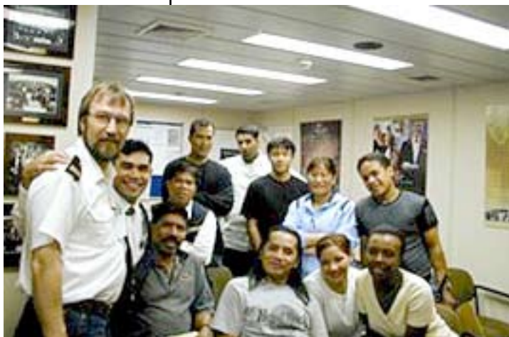
Church on-board QE2